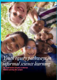
Youth equity pathways in informal science learning: infographic