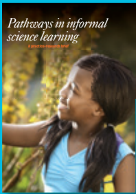
Research and practice brief 2: Pathways in informal science learning